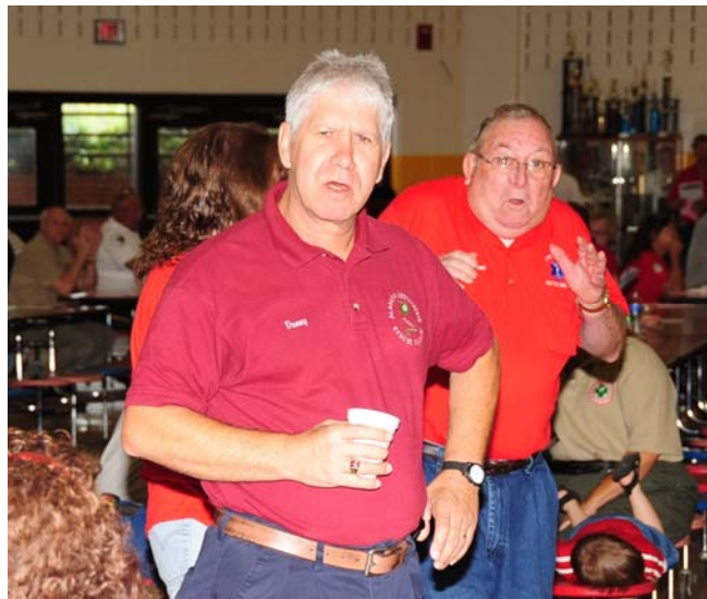
Can't I have just ONE cup of coffee??

121 Autumn Oak Lane Harvest Alabama 35749 "An All Volunteer Search Dog Unit Helping Others"