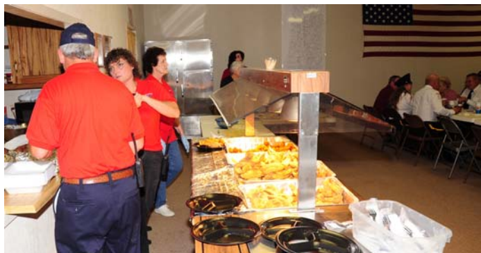
Good food provided by South Lamar Rescue Squad