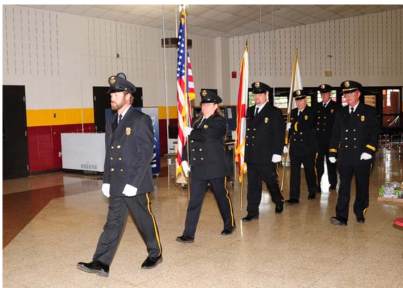
AARS Honor Guard in Class A uniform presenting the Colors.