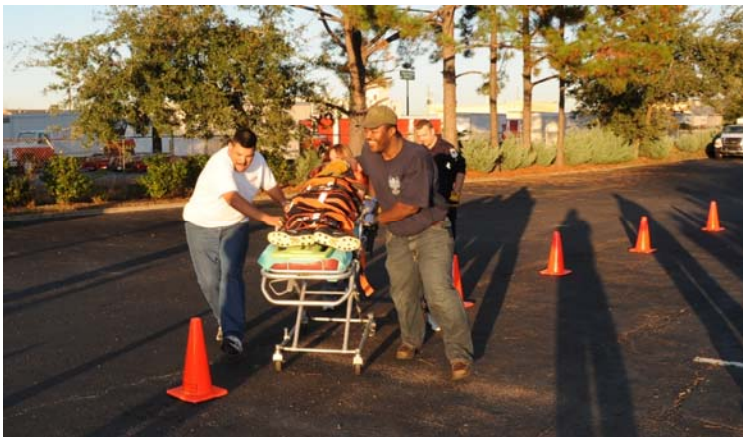
Rescue Challenge