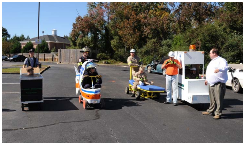
Ramblin' Rescue Competition.