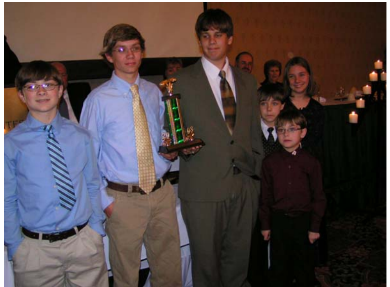
The next generation of rescuers!