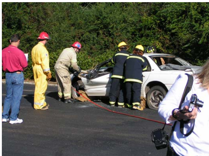
Extrication Competition.