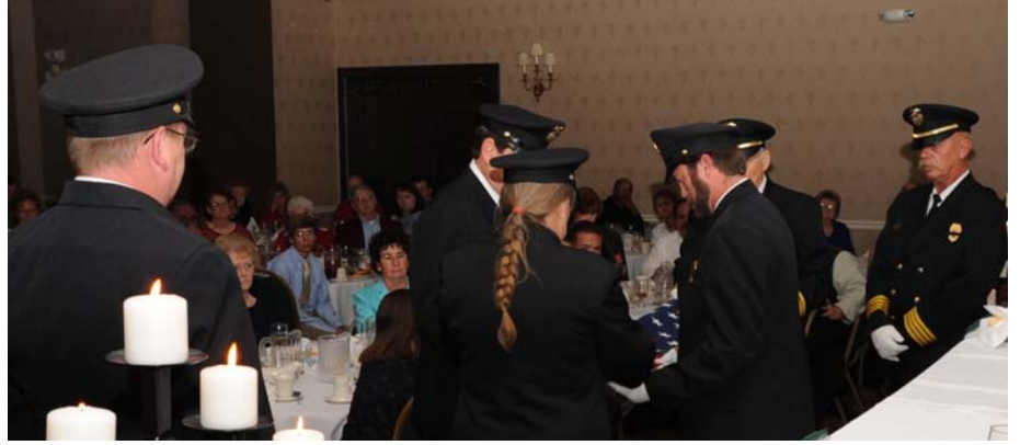
AARS Honor Guard Memorial Service at 2008 Annual Conference.