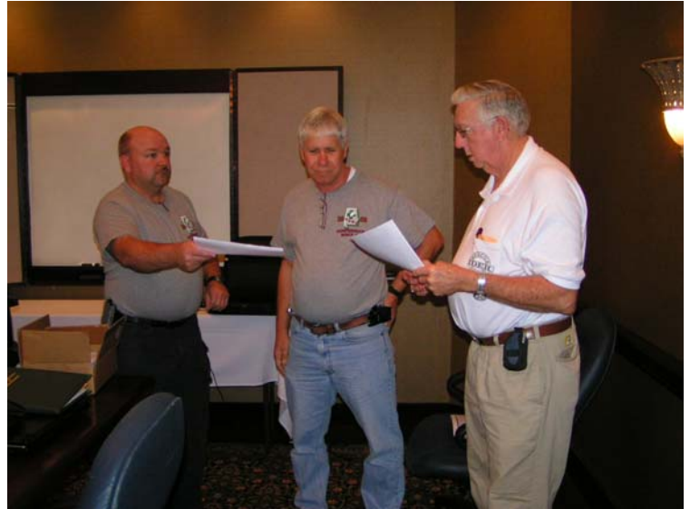
Is this a meeting of the minds?

To everyone in Search and Rescue.....keep doing what you are doing because we have a purpose.