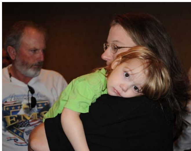
Too much excitement for this little rescuer!