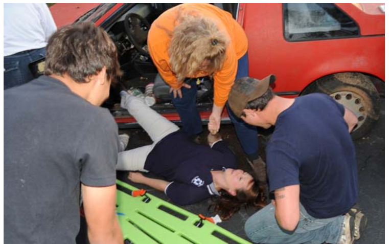
First Aid Competition