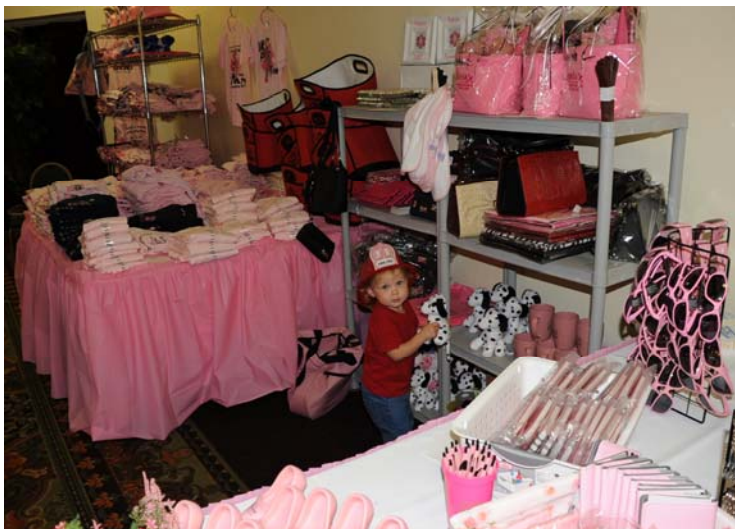
“Can he come home with us, Mama?”

** 2009 QUARTERLY MEETINGS ARE BEING HOSTED BY: 1ST QUARTER: CLIO RESCUE SQUAD 2ND QUARTER: PECKERWOOD RESCUE SQUAD 3RD QUARTER: DEKALB COUNTY RESCUE SQUADS