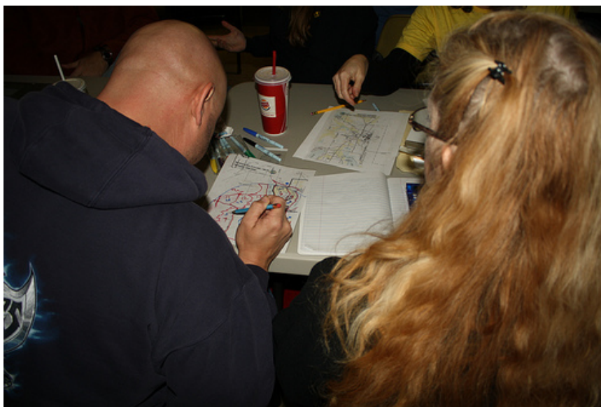
One of the groups working the final tabletop exercise, setting the boundaries of their search area based on statistical data, and then segmenting their search area into searchable sizes.