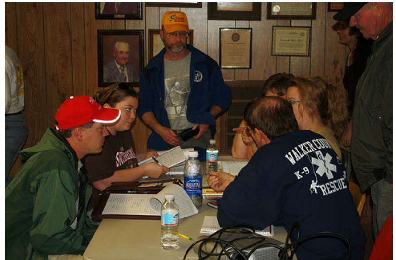
Another group exercise, working objectives for the operational period, and what resources can help meet the objectives.