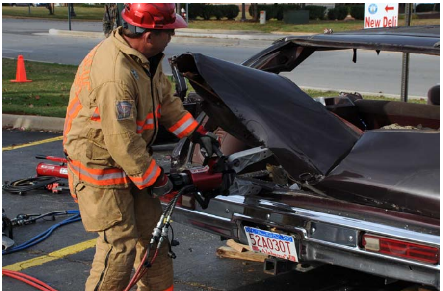
Extrication Demonstration at 2009 Conference