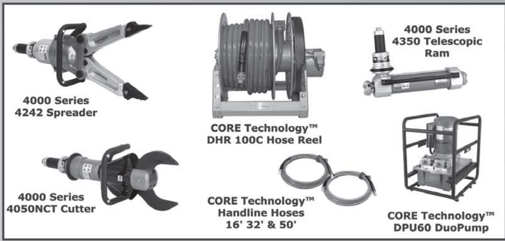
4000 Series 4242 Spreader

New 4000 Series - Featuring CORE Technology™