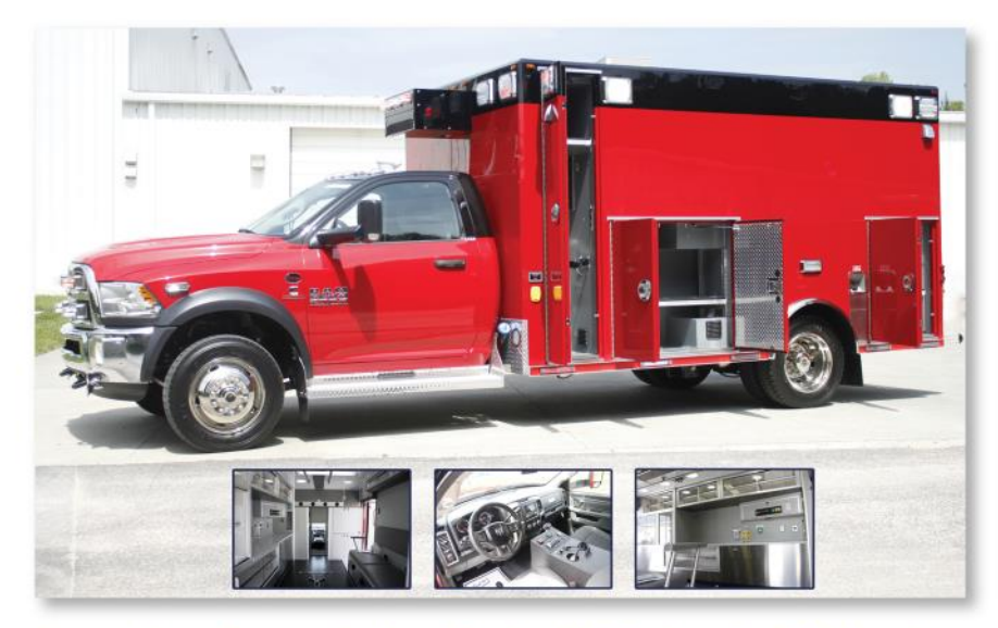
Osage Type 1 mounted on Dodge 4500 chassis, 168" body