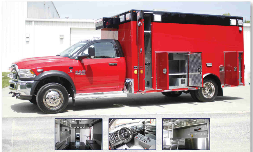
Osage Type 1 mounted on Dodge 4500 chassis, 168" body