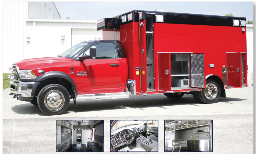
Osage Type 1 mounted on Dodge 4500 chassis, 168" body