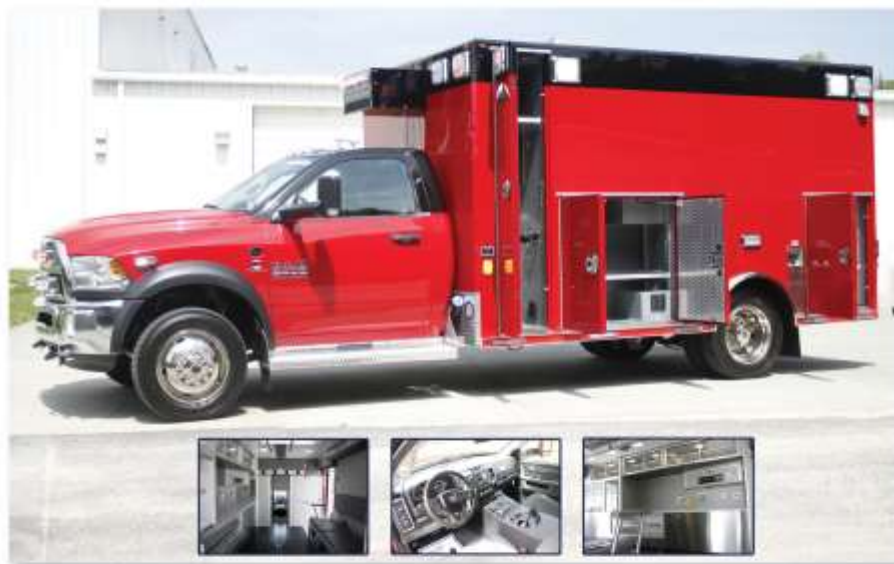
Osage Type 1 mounted on Dodge 4500 chassis, 168" body