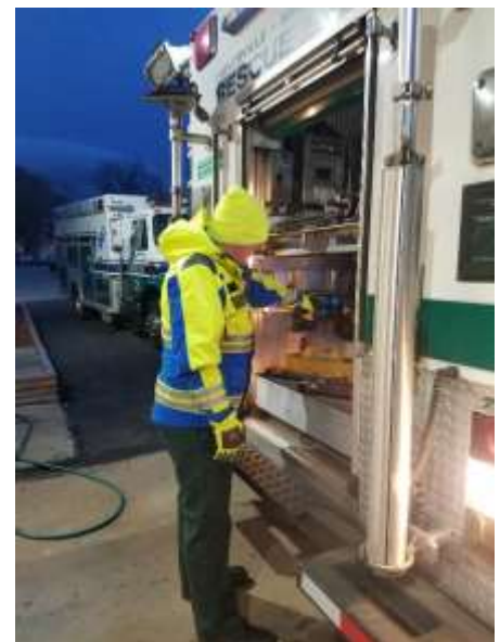
Coming on duty process for trainees includes identifying everything .