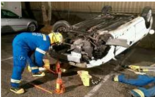
In house stabilization training

The AARS motto teaches us to be prepared for the unexpected. Training begins. It never ends.