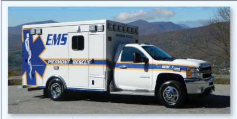
GX3 Remount for Piedmont Rescue

Osage Type 1 mounted on Dodge 4500 chassis, 168" body