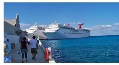
REGISTRATION CALL OR E-MAIL

WE WILL TRAIN DURING THE DAY AND ENJOY SOME EXOTIC FUN AND ENTERTAINMENT FROM THE CREW AND THE SITES OF THE SHIP DURING THE EXILIRATING SHOWS AND MANY EVENTS ON BOARD THE CARNIVAL CRUSE SHIP