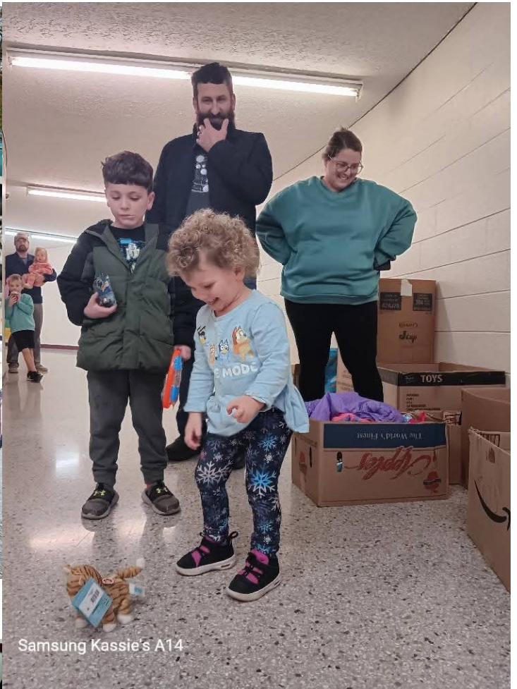
Samsung Kassie's A14