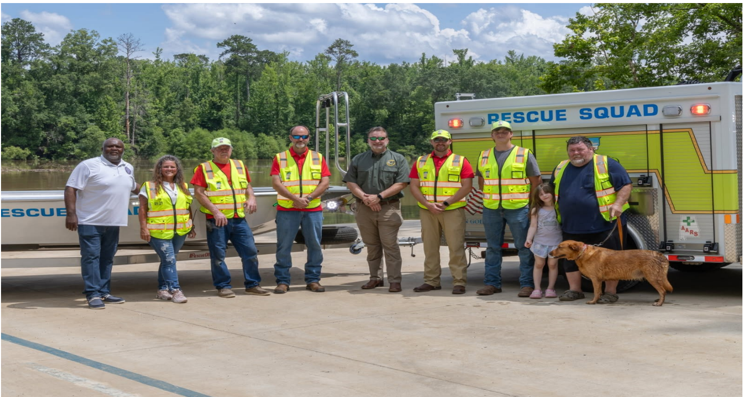
Choctaw County Rescue